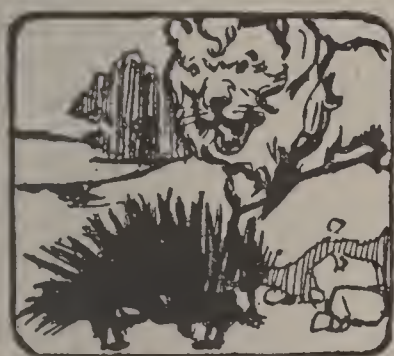
The Lion Looked at the Quills.

“ONCE upon a time,” began daddy, “there lived way off in the woods—the dense, black woods where people never go—a family of porcupines. Now, you know, children, porcupines have long, sharp quills that look dangerous.”